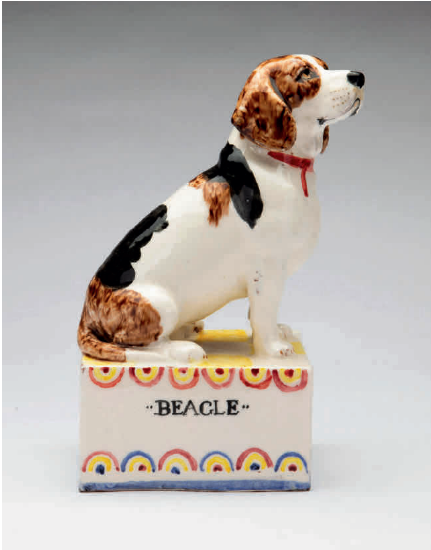
56. A David Cleverly model of a seated 'Beagle', on titled rectangular base, 8 ½" high, signed in black