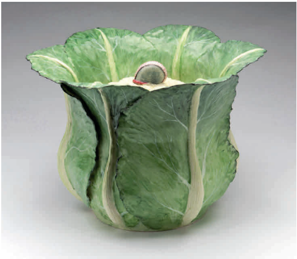
9. An unusual Anne Gordon porcelain large cauliflower shaped bowl and cover, the finial in the form of a snail, 10 ¾" diameter, signed in black and dated '99