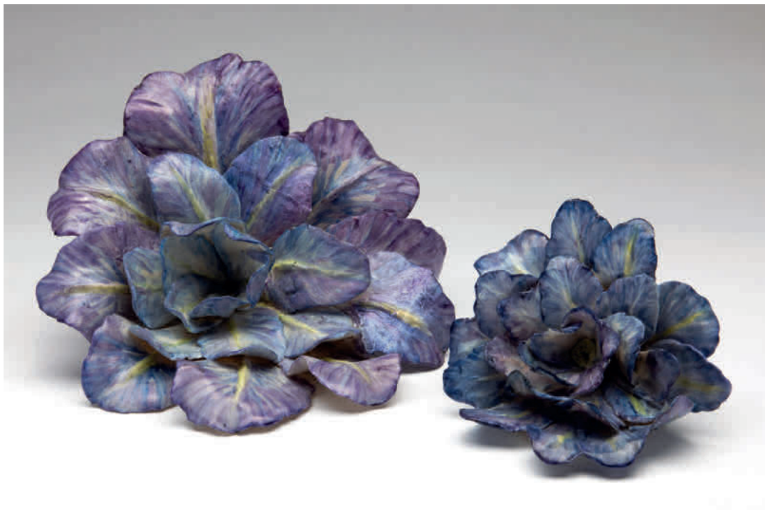
36. An Anne Gordon porcelain model of a blue and yellow variegated flower head, 6 ½" wide, signed in blue and dated '83