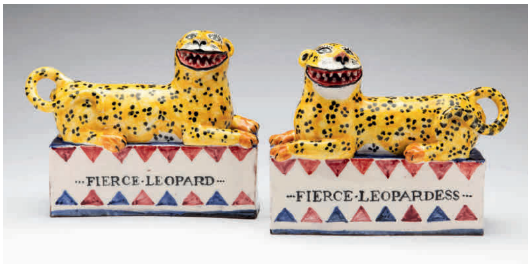
72. A pair of David Cleverly models of 'Fierce Leopard' and 'Fierce Leopardess', each on titled rectangular base, 8" wide, signed in black