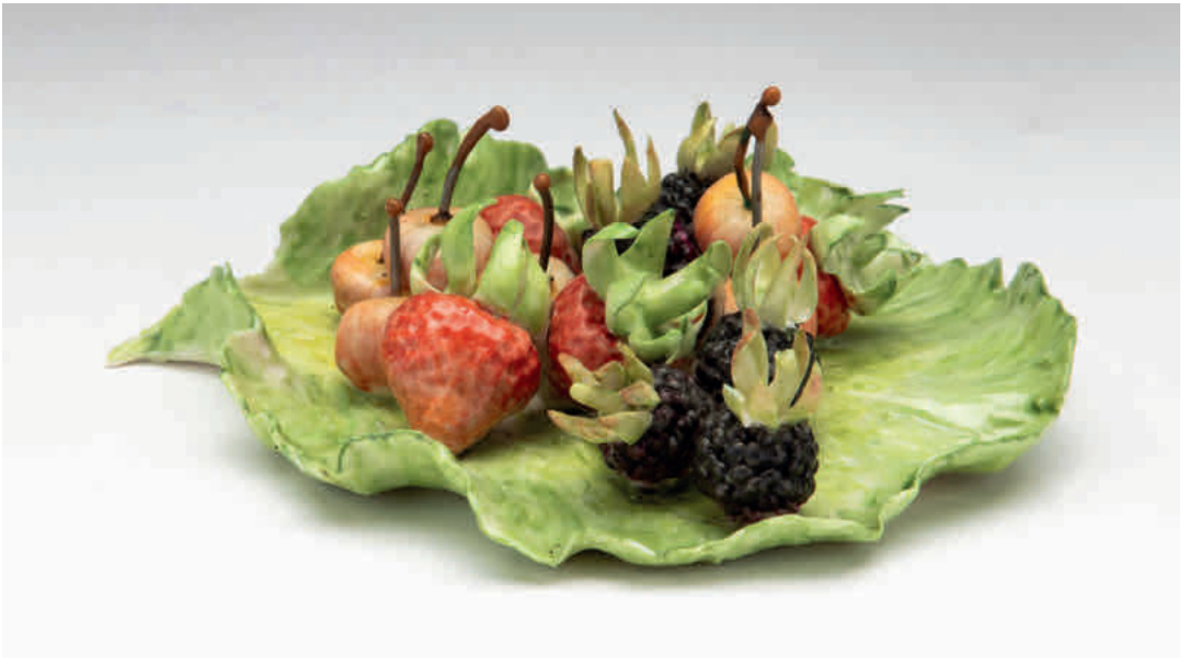
32. An Anne Gordon porcelain model of blackberries, strawberries and cherries on a leaf, 6 1/4" long, signed in blue and dated '87