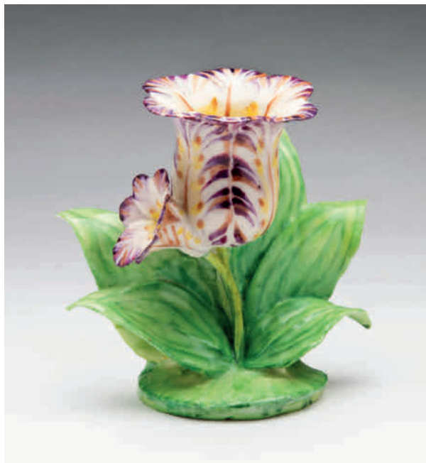
6. An Anne Gordon porcelain model of a purple and yellow variegated tulip and a bud, 5" high, signed in black and dated '98