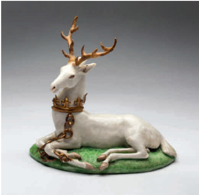
23. An Anne Gordon porcelain model of a recumbent stag, with gilt coronet collar and chain, on green glazed oval mound base, 7 ½" wide, signed in blue and dated '83