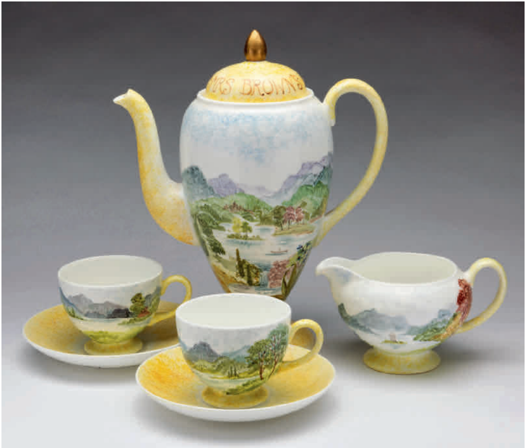
46. A Wedgwood bone china ovoid coffee pot and cover, painted in coloured enamels by Anne Gordon with a mountainous river landscape, and inscribed 'Mrs Brown's coffee pot', 10" high, printed Wedgwood mark, with a matching milk jug and two tea cups and saucers