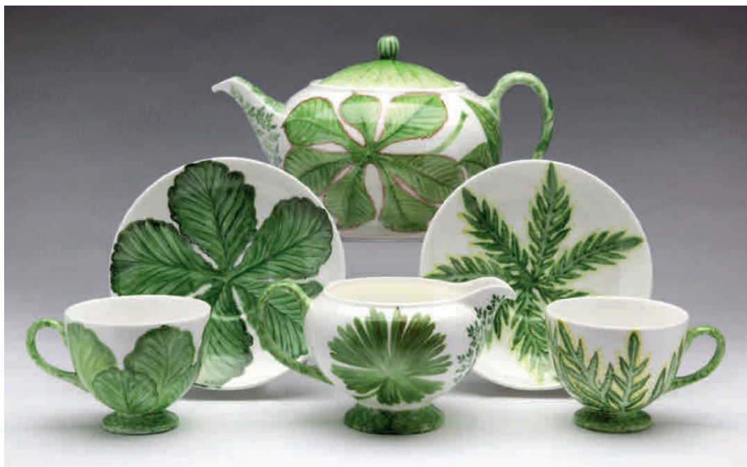
34. A Wedgwood bone china round teapot and cover, painted by Anne Gordon with green leaves, 5" high, printed Wedgwood mark in black, with a matching milk jug and two tea cups and saucers