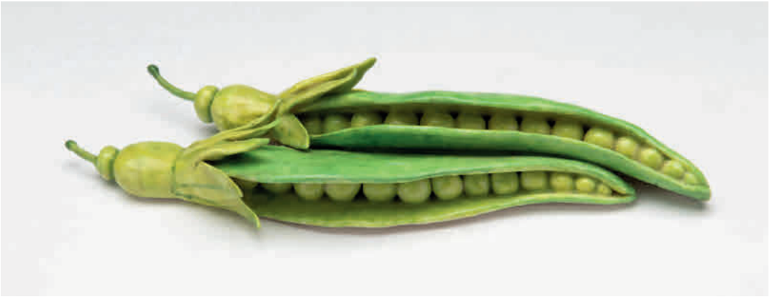
16. An Anne Gordon porcelain model of two pods of peas, 6 \frac{3}{4} " long, signed in black and dated '97