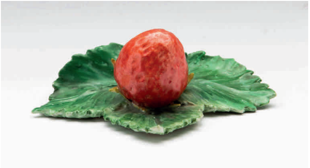
5. An Anne Gordon porcelain model of a strawberry on three leaves, 4 ½" wide, signed in blue and dated '79