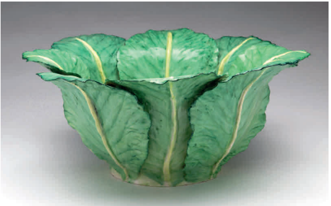
24. An unusual Anne Gordon porcelain large flared bowl, in the form of overlapping cabbage leaves, 13 ¼" diameter, signed in black and dated '96