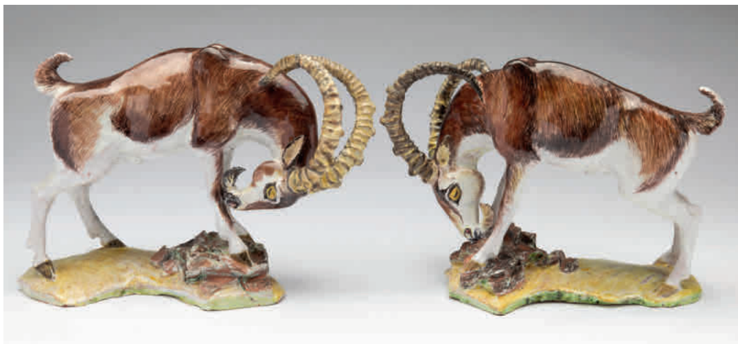
33. An unusual pair of Anne Gordon faience models of antelopes, each on mound base, 8" long, signed in black and dated '76