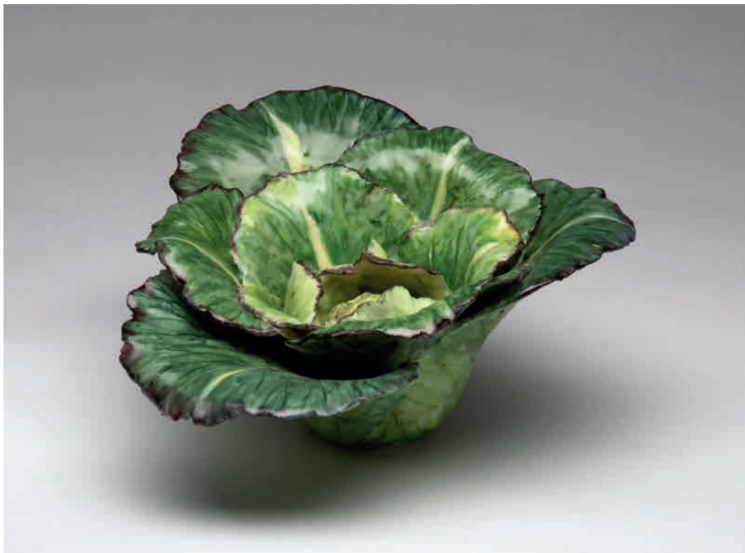
53. An Anne Gordon porcelain model of a cabbage, the leaves edged in purple, 6" wide, signed in black and dated '94