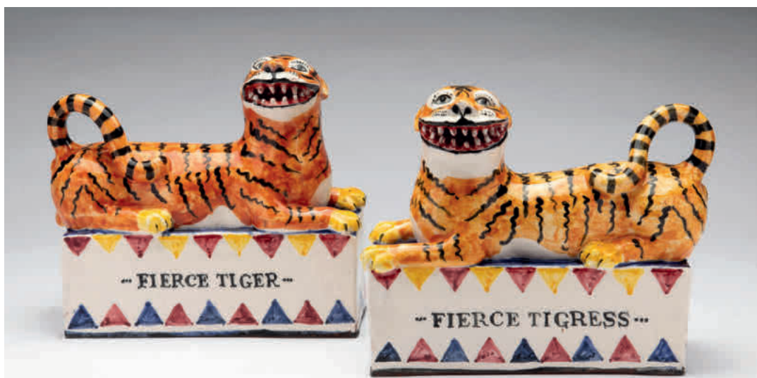
73. A pair of David Cleverly models of 'Fierce Tiger' and 'Fierce Tigress', each on titled rectangular base, 8" wide, signed in black