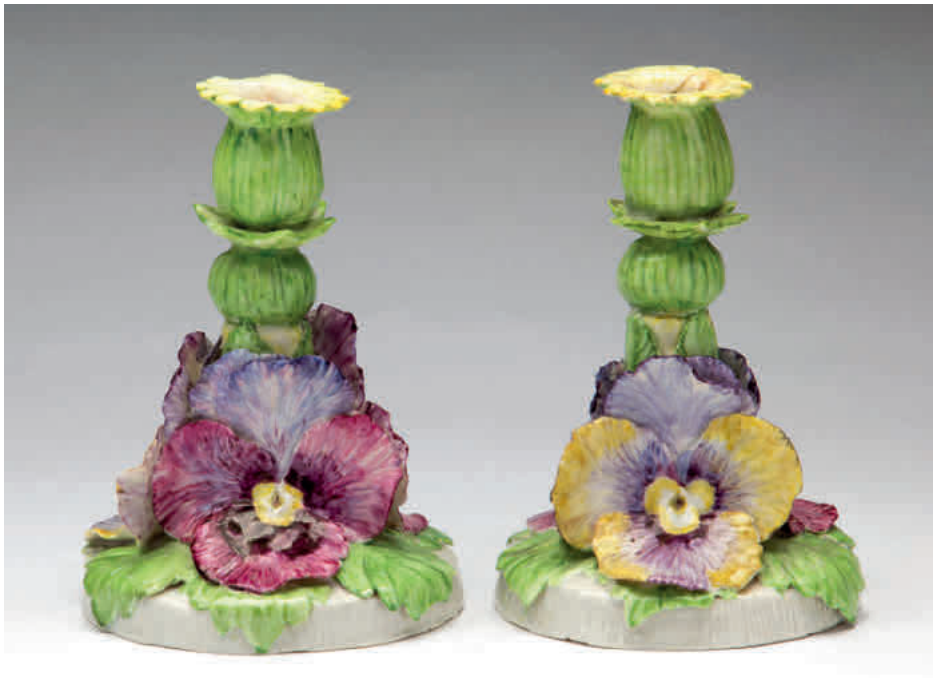
43. A pair of Anne Gordon porcelain candlesticks, each in the form of three pansy heads, surrounding a knopped and leaf moulded stem, on round base, 6" high, one signed in blue and dated '83