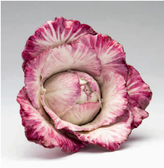
31. An Anne Gordon porcelain model of a red cabbage, 6" diameter, signed in black and dated '85