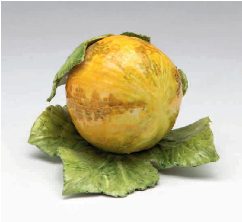
17. An Anne Gordon porcelain model of a melon, resting on leaves, 4 \frac{1}{2} " wide, signed in black and dated '84