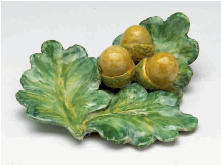
42. An Anne Gordon porcelain model of three acorns on oak leaves, 4" wide, signed in blue and dated '79